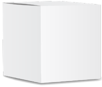
Boxed / Panel Goods