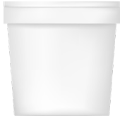
Straight / Tapered Buckets